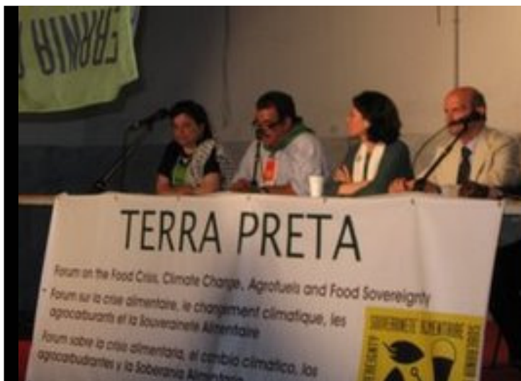
~ CSO Leaders at the Terra Preta Forum.

The outcome of that meeting was a package of supports for agriculture, put together largely by governments, international foundations and private industry, to increase short term aid and encourage small-scale farmers to follow the high-input model of agriculture practiced in developed countries.